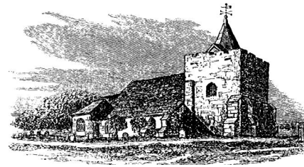
St Nicholas, Leeds

For more information visit our website at www.friendslbc.org.uk or you can telephone the Membership Secretary on 01622 862316.