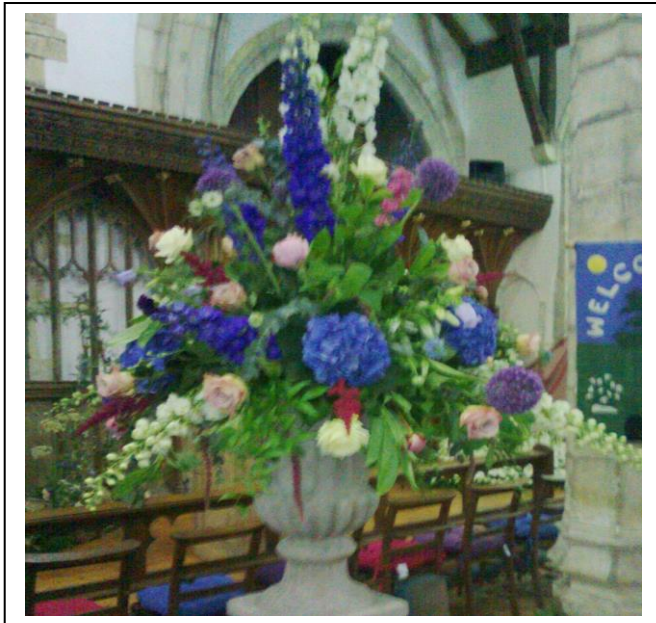
An exhibit by Leeds Castle florists commemorating the 300th anniversary of the birth of Capability Brown

Anniversaries, anniversaries, anniversaries..... was the theme of our Flower Festival in June this year.....and so many different ones too.