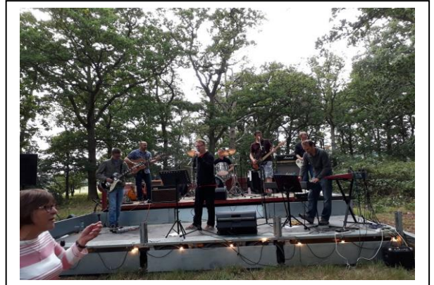
The band with no name entertaining us all!

We offered food all cooked with meat from the farm, games for children, a raffle and last but not least a band (with no name!) who played a great selection of old and new tunes, everyone was dancing and singing. It turned out to be a cloudy day but in the woodland there was a very friendly, happy atmosphere.