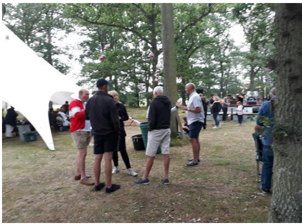
Guests enjoying the different beers