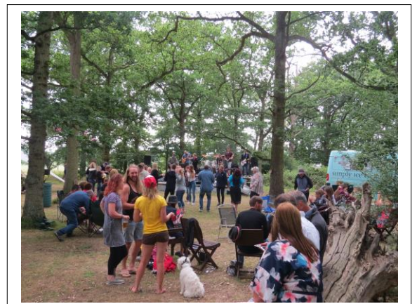
A lovely way to spend a summer's day