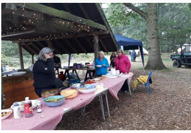
Food, glorious food...