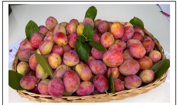
Some of the wonderful Victoria plum harvest this year.....delicious!

Our current project is helping to restore the tower of Broomfield church to which we have committed the sum of £15,000.