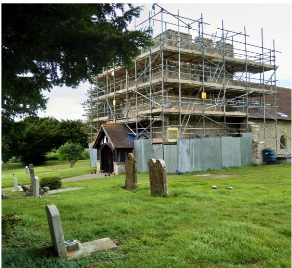
Broomfield church tower under repair

This year although we have put on some splendid events (more of which on page 6) to raise funds, we have focussed very much on supporting the maintenance of both of our churches both inside and out with substantial donations.