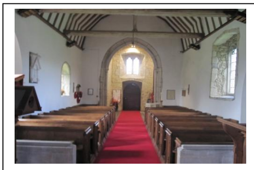
New lighting at the tower end of Broomfield church

Over the years that the Friends have been in existence we have contributed more than £31,000 to work done in these ancient buildings but there is still a great deal to do at both churches to comply with their quinquennial reports and this is likely to include repairs to the stonework of Broomfield church and repairs to the roof of Leeds church.....more news next year.