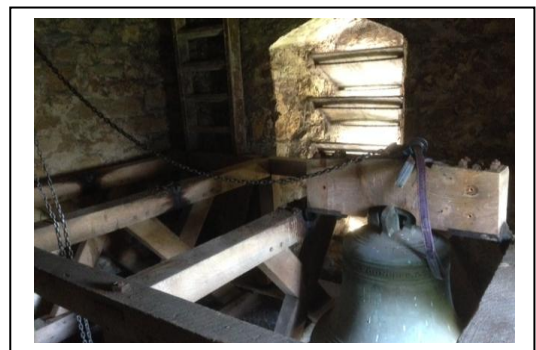
Repairs have been made to beams in Broomfield tower